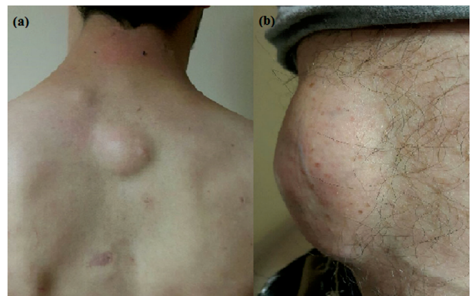
Figure 2 | (a) Multiple epidermal cysts on the back, (b) Giant epidermal cyst on the right leg, 6 \times 3.5 \times 2.5 cm.