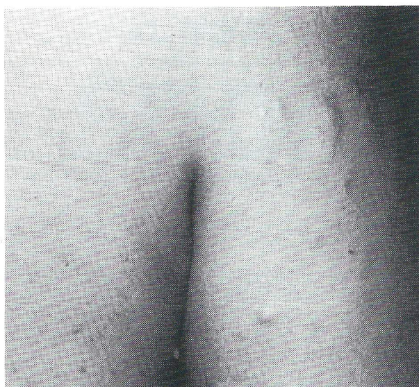
Fig. 2. Clinical aspects of middermal elastolysis

Case 2. In a 29 year-old woman, numerous, asymptomatic, discrete, yellowish papules, 0.5-0.8 cm in diameter appeared