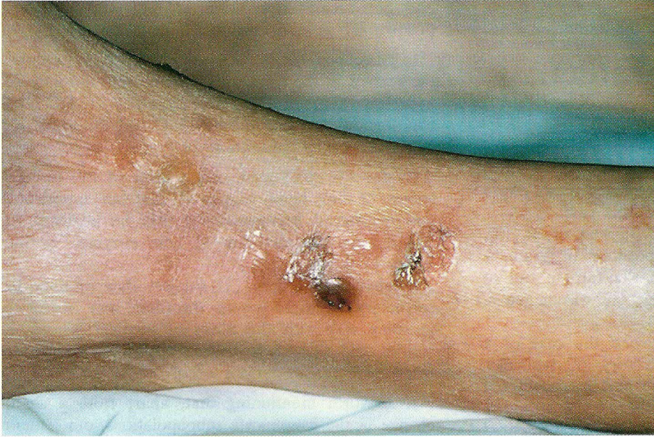
Fig. 1. Clinical aspect: erythematous bullous lesions on the leg.