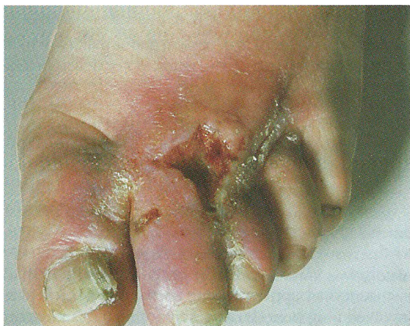
Figures 3 a and b. Ulcer of the left forefoot before and after treatment with topical Factor XIII

The patient was treated in our outpatient clinic with