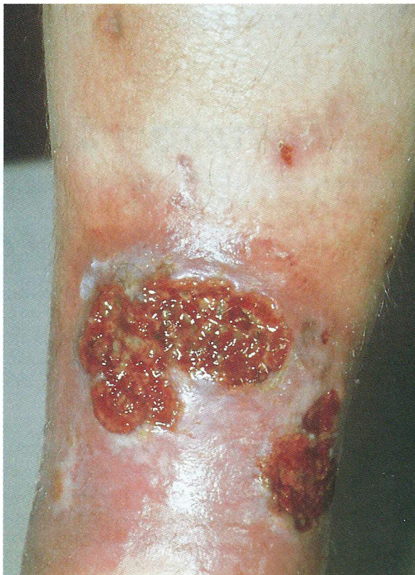
Figure 2. Heavily exsuding pHeaHHh retibial ulcer of patient with XXYY-syndrome

revealed an unusually tall, obese boy with gynecomastia and hypoplastic testes (Figure 1). Both legs presented with ulcerations on the medial and frontal aspect of the shin (Figure 2) as well as the dorsum of the left foot (Figure 3a). The ulcerations measured up to 6 cm in diameter and were covered with large quantities of fibrinous exsudate. There were no conspicuous varicose