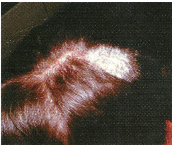
Figure 1. Lesion on the scalp caused by M.canis .

Sixteen children (10 males and 6 females, aged 6-12 years) with tinea capitis caused by Microsporum canis were included in the study. Demographic characteristics of the patients are presented in table 1. Children treated with other antimycotics and with isolation of Trichophyton sp. from the lesion were excluded. The diagnosis was based on clinical examination, Wood light, and direct microscopy of scrapings from the lesion with potassium hydroxide