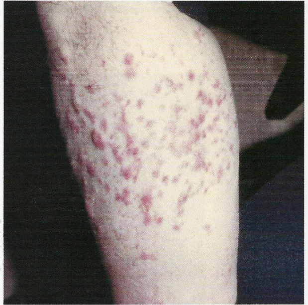
Figure 4. Trombidiosis . Macular and papular lesions on the leg.