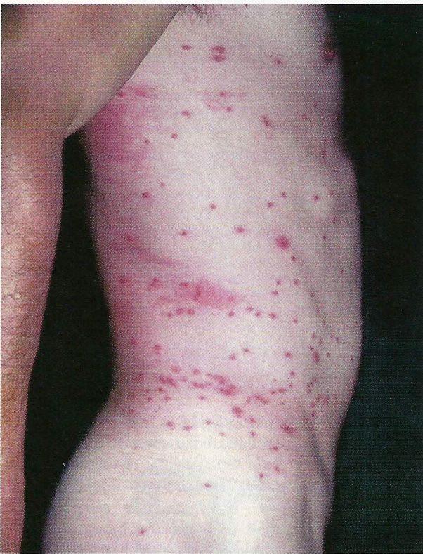
Figure 2. Trombidiosis in a male patient: macular and papular lesions concentrated around the belt area.