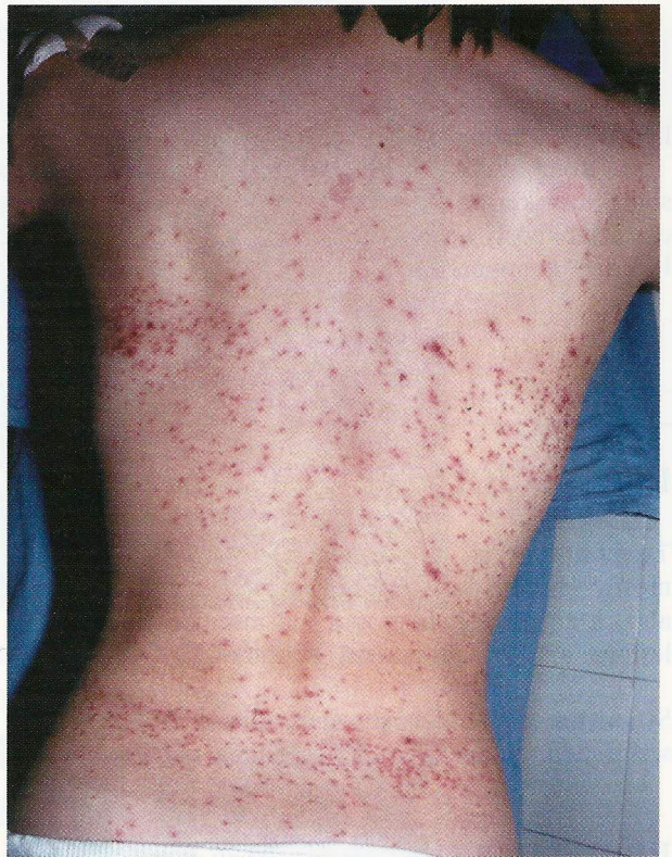
Figure 3. Trombidiosis in a female patient: macular and papular lesions expressed mostly around the belt and the bra areas.