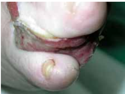
Figure 1. The tumor; description in the text.

granular, spongy surface and a barely visible ulceration had grown in about 3 months. On admission, the diameter of the tumor was 4 cm (Fig. 1.). The surrounding epidermis showed slight maceration. The peripheral lymph nodes were not enlarged. There was no weight loss during the previous 3 months. An undifferentiated, atypical squamous cell carcinoma was first diagnosed.